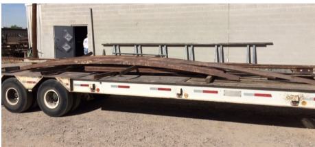
Rail being loaded for transport to the new 36 th St. preservation yard.