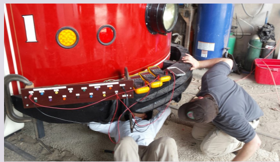
Test leads are checked and monitored.