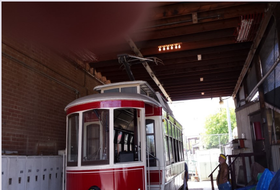
600 V DC was fed to the car through the pantograph

Watch the video on YouTube at https://youtu.be/MIQysZng8qo